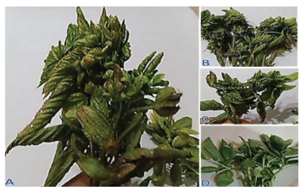
Fig. 1. Leaf deformities, slight yellowing, crinkled leaves, and phyllody symptoms on C. olitorius leaves affected by phytoplasma disease from Fayoum Governorate (A-C) as compared to healthy ones (D)

The nested PCR assays of all the collected samples were tested using universal primer pairs (P1/P7 and R16F2n/R2), and generated fragments of 1271 bp typical to phytoplasma from five symptomatic C. olitorius samples. No fragment was obtained from the other samples from non-symptomatic plants also collected from the Fayoum Governorate (Fig. 2). The DNA from a healthy C. olitorius plant, used as a negative control, generated no amplicon.