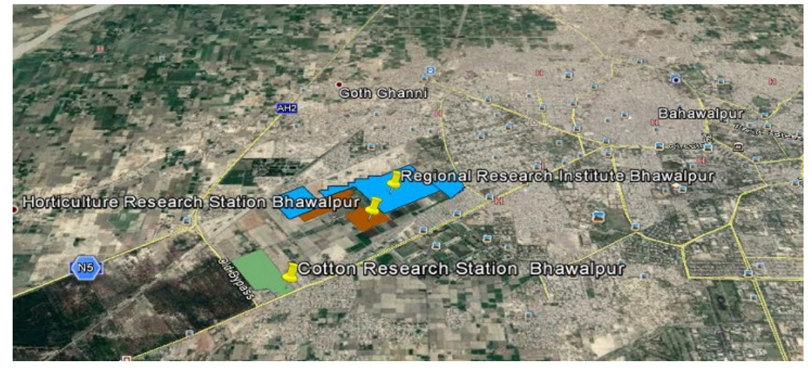
Fig. 2 (a). Location map of the study site

as well as yearly recurring infections caused by teliospores, resulting in larger reduction in yield. High moisture, on the other side, may enhance fatal germination, in which teliospores develop in the absence of a host, lowering inoculum concentration. Some picture from the study area and bunted wheat seeds are depicted in Fig. 2 (a,b).